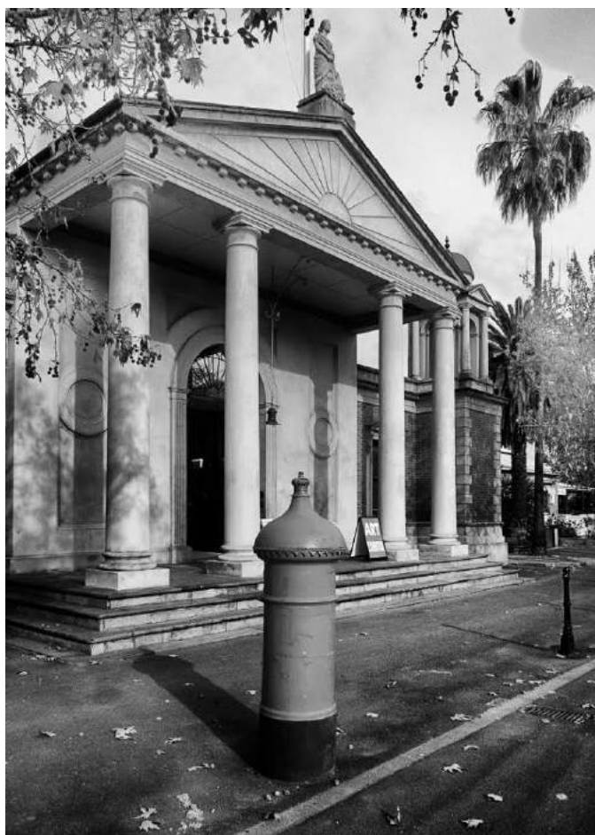
Market Building, Castlemaine